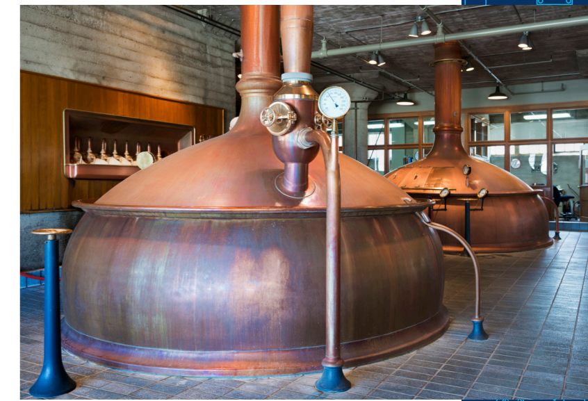
TrustEE focuses on energy efficiency measures and renewable energy solutions for industrial process heating.