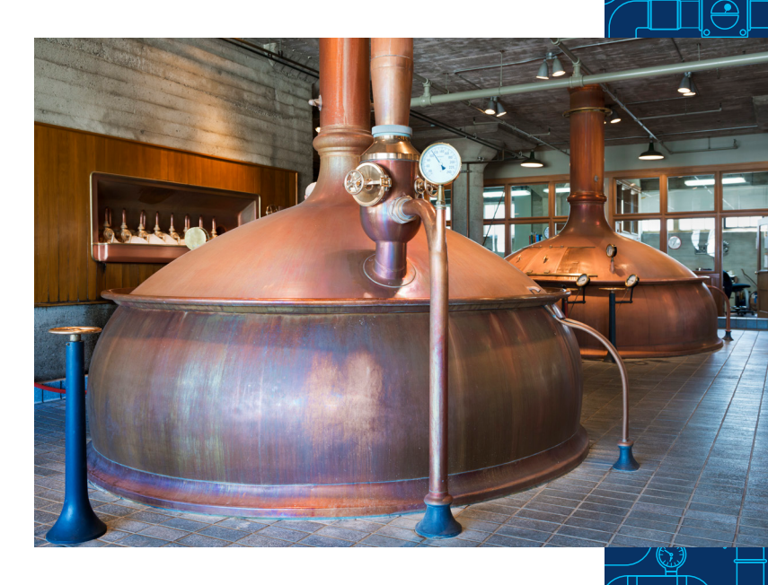
TrustEE focuses on energy efficiency measures and renewable energy solutions for industrial process heating.

• Sustainable investments with attractive financial returns